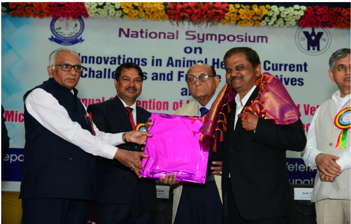
Felicitation at National Conference of IAVMI held during 29 th -31 st Jan 2018 at Tirupati