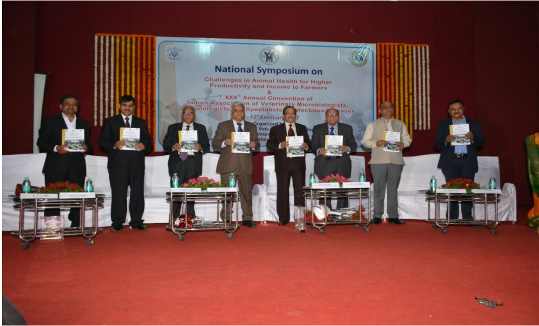
Organization of National Conference of IAVMI by Department Veterinary Microbiology during 10 th -12 th Feb 2017